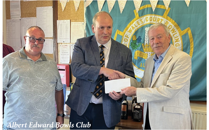
Albert Edward Bowls Club

A new event this year was the inaugural inter Province Bowls Match between the South Wales and Monmouthshire Mark Provinces held at the Albert Edward Bowls Club in Porthcawl.