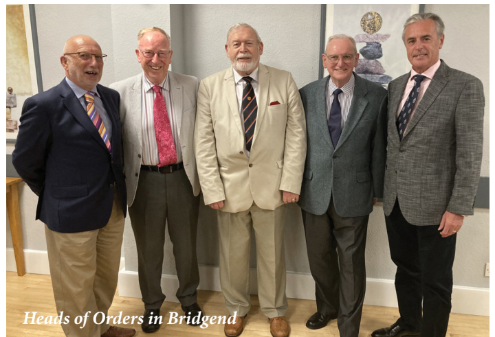
Heads of Orders in Bridgend

The annual 'Ins and Outs' luncheon took place recently at Bridgend and was well supported. The Provincial Grand Master was delighted to welcome the Heads of four other Orders in the Province who are all Mark Masons.