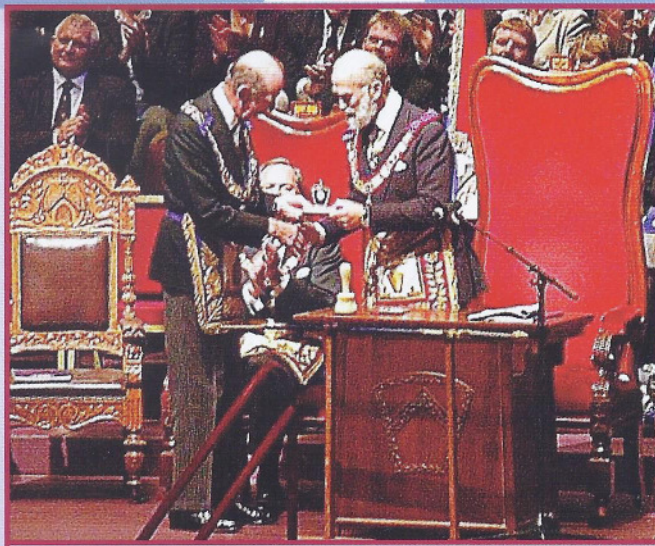
Two Grand Masters—two Brothers (Rt. Worshipful) Prince Michael presents a commemorative Mark Stone to the His Royal Highness the Duke of Kent Rt.W. Grand Master in the Craft.